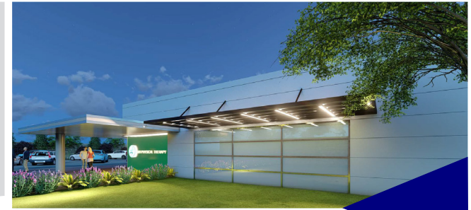
Conceptual Entry Design for the Proposed New IMH Rehabilitation Therapy Center