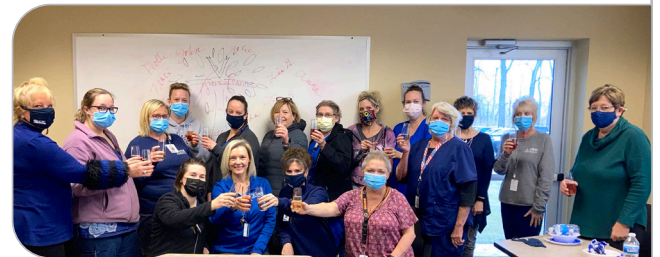
Toasting to 26 years of caring for patients and their families