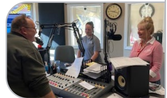
WGFA Business of the Day